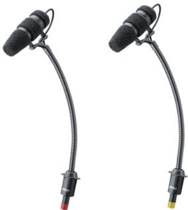
4099 for Loud SPL